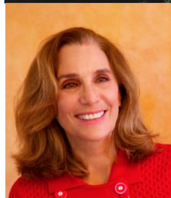
Skidmore '69 Present Day